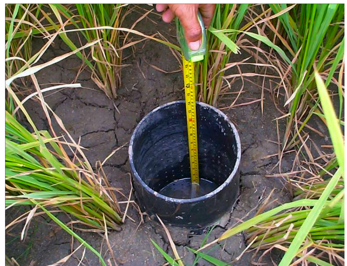
Figure 1. Field water tube used for observation of water levels by farmers. The ability to observe the level of the water table below the soil helps build confidence in AWD.

Reduced water use. By reducing the number of irrigation events required, AWD can reduce water use by up to 30%. It can help farmers cope with water scarcity and increase reliability of downstream irrigation water supply.