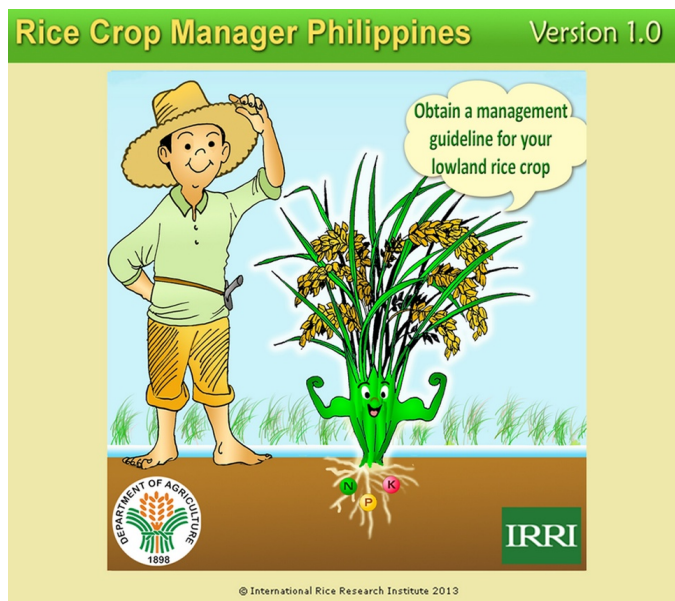
Figure 4. Rice Crop Manager is an open-access web application that allows extension agents to enter basic location and management information in the field and give farmers immediate fertilizer recommendations.

A decade of research at IRRI has developed the approach of site-specific nutrient management. This approach allows farmers to tailor nutrient management to the specific conditions of their field. IRRI has developed a computer- and mobile phone-based application called Rice Crop Manager that provides farmers with site- and season-specific recommendations for fertilization. The tool allows farmers to adjust nutrient application to crop needs in a given location and season.