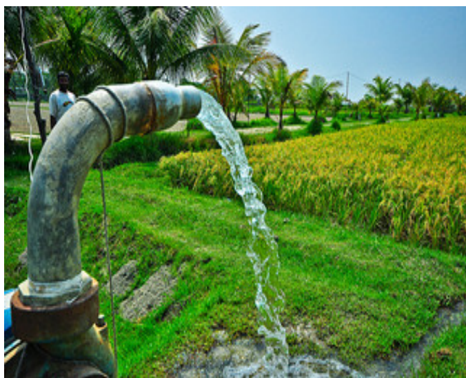
Figure 3. Pump irrigation in the Philippines.

Proper design of irrigation schemes and coordination among farmers, irrigation authorities, and local governments can enable large-scale benefits from AWD. In the Philippines, water for irrigation is a limited and dwindling resource due to competition with residential and industrial uses, increasing frequency of drought, and pollution of surface waters. Since the early 2000s, the International Rice Research Institute (IRRI) has collaborated with the Philippine Rice Research Institute (PhilRice) and the National Irrigation Administration (NIA) of the Philippines to disseminate AWD as a water-saving technology. These efforts became more urgent in 2009, when decreasing irrigation water supply during the dry season led the Department of Agriculture to issue an administrative order for the adoption of water-saving technologies in irrigated rice production. This created an opportunity for large-scale implementation of AWD, with benefits not only for water savings but for coping with climate change as well.