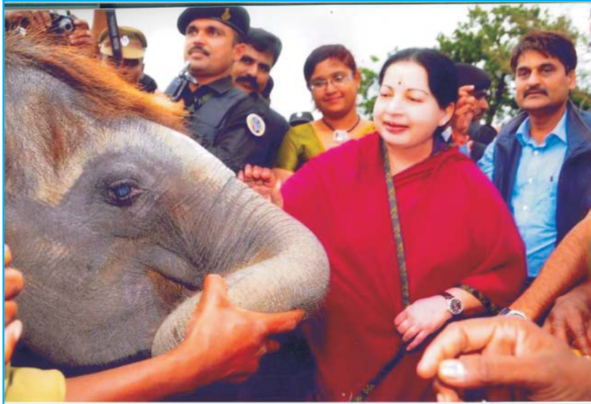
Hon'ble Chief Minister visits an elephant calf at Mudumalai Tiger Reserve at Theppakkadu