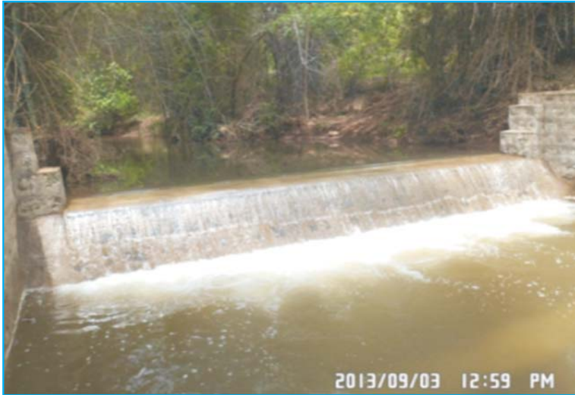
Check dam constructed at Salem under water conservation and canopy improvement scheme