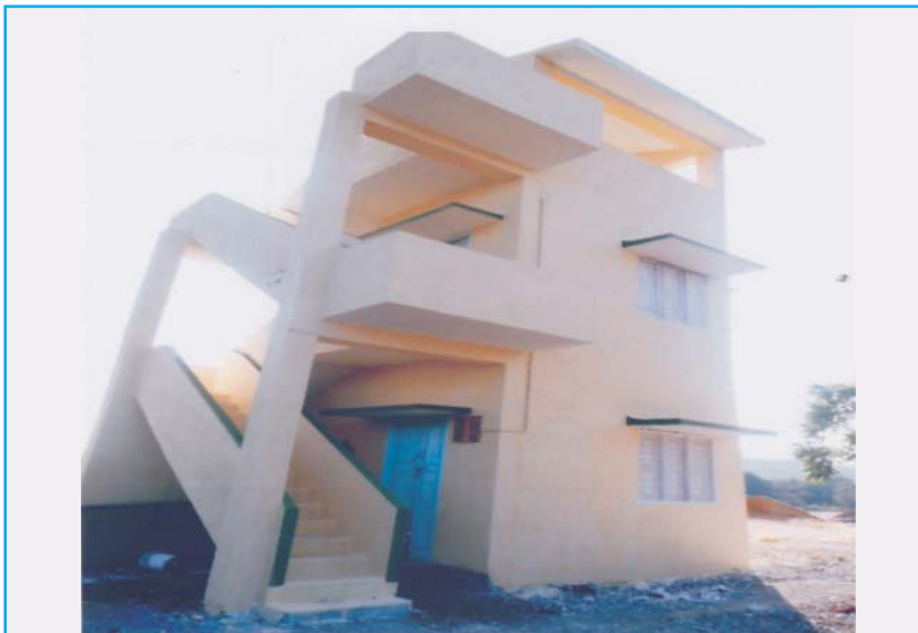
Anti-poaching shed-cum-watch tower constructed in Tirupattur division under 13th Finance Commission