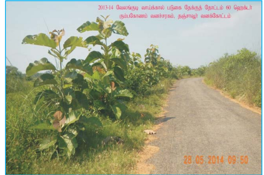
Teak plantations raised in the padugai of Velankudi canal bank of Thanjavur division