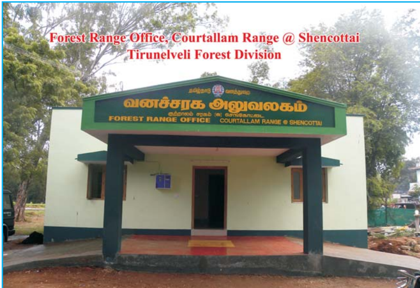
Newly constructed Forest Range Office of Courtallam Range inaugurated by Hon'ble Chief Minister through video conferencing.