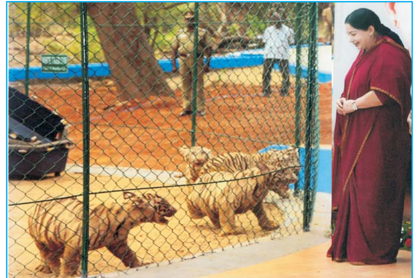
Hon'ble Chief Minister named the four white tiger cubs and three normal coloured tiger cubs at a function held at Arignar Anna Zoological Park, Vandalur