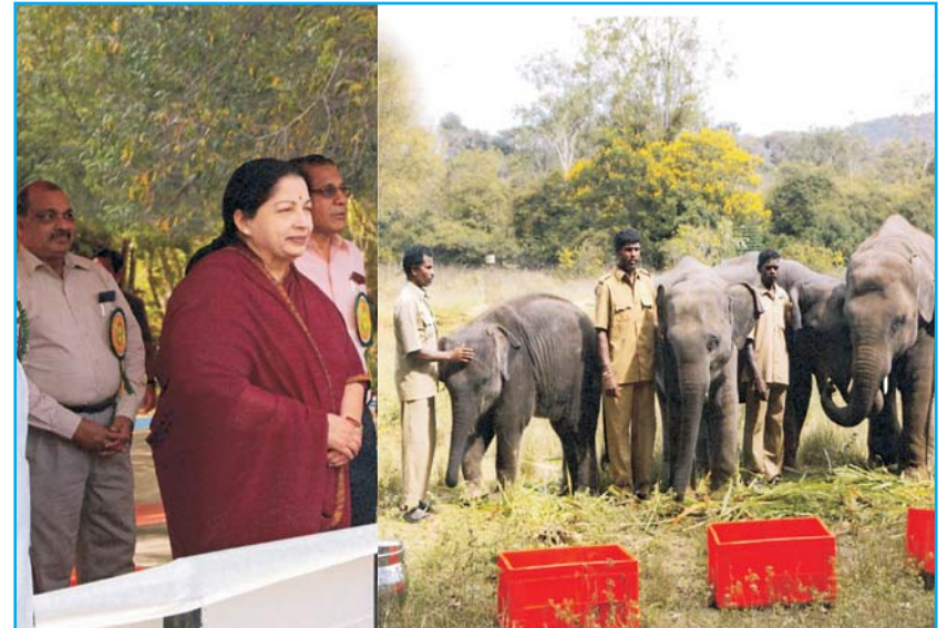
Hon'ble Chief Minister visited the four orphaned male elephant calves at Arignar Anna Zoological Park, Vandalur