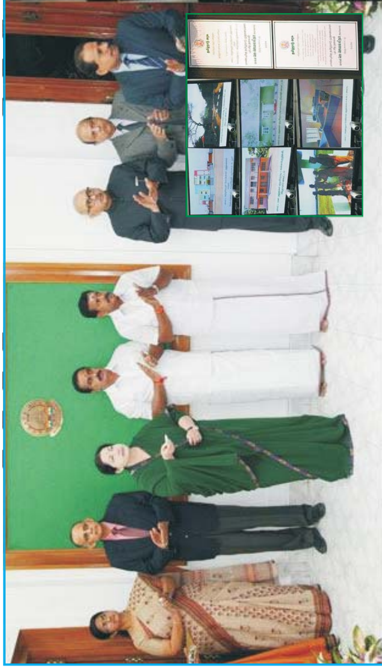
Hon'ble Chief Minister inaugurated 100 newly constructed forest department buildings on 25.06.2014