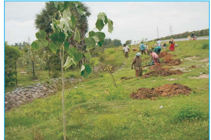
Planting under the scheme 'replanting in Thane cyclone affected areas' in Villupuram division