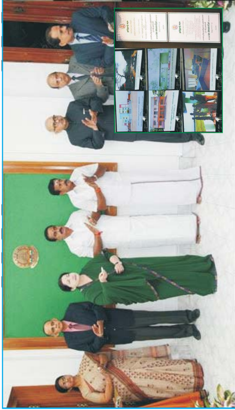
Hon'ble Chief Minister inaugurated 100 newly constructed forest department buildings on 25.06.2014