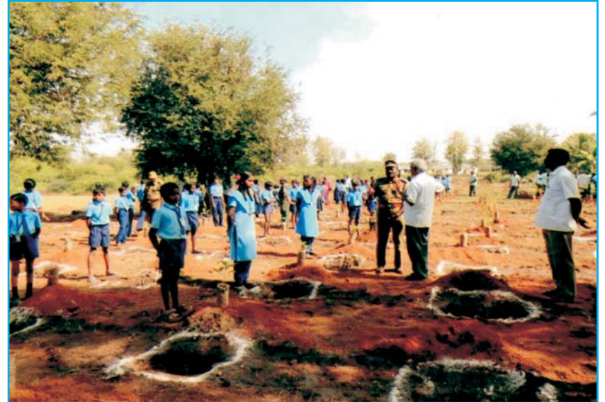
Before Massive Tree Planting : Moongilthuraipatti of Kallakurichi during 2012-13