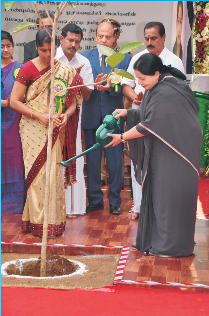
Hon'ble Chief Minister launching massive tree planting drive to mark the occasion of her 66th birthday at State Police Headquarters, Chennai