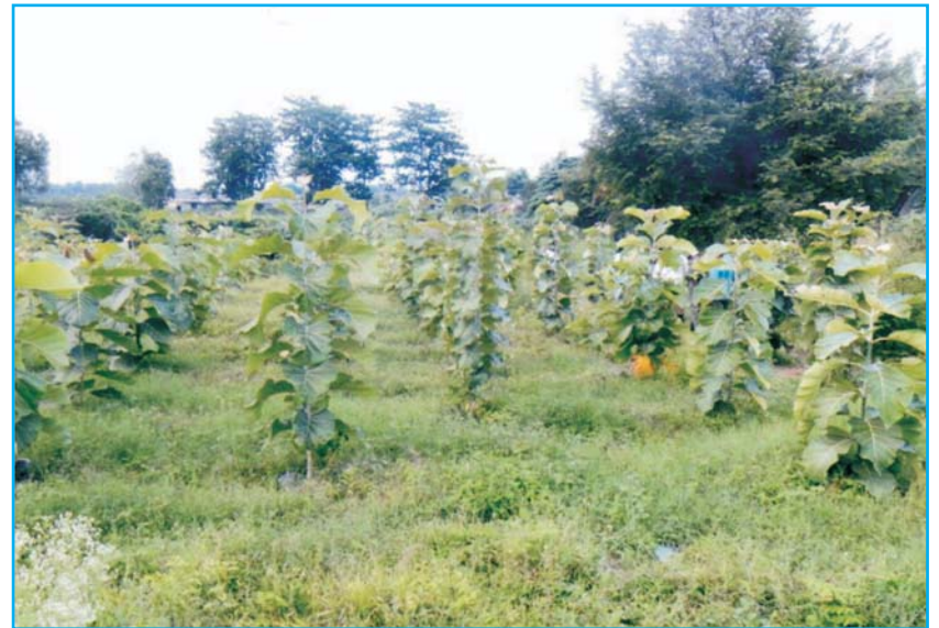
After Massive Tree Planting : Moongilthuraipatti of Kallakurichi during 2013-14