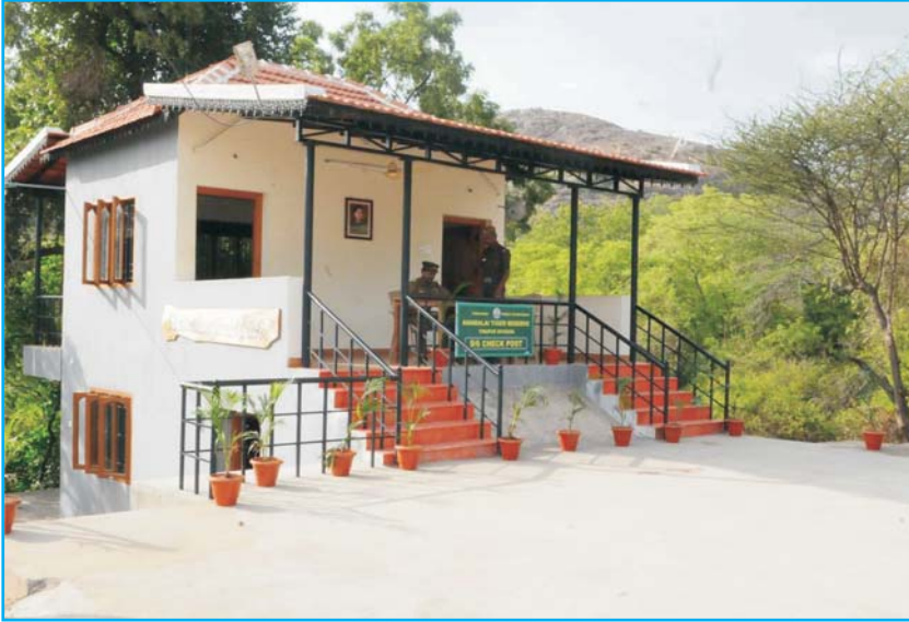
Check post constructed at Tiruppur division under 13th Finance Commission