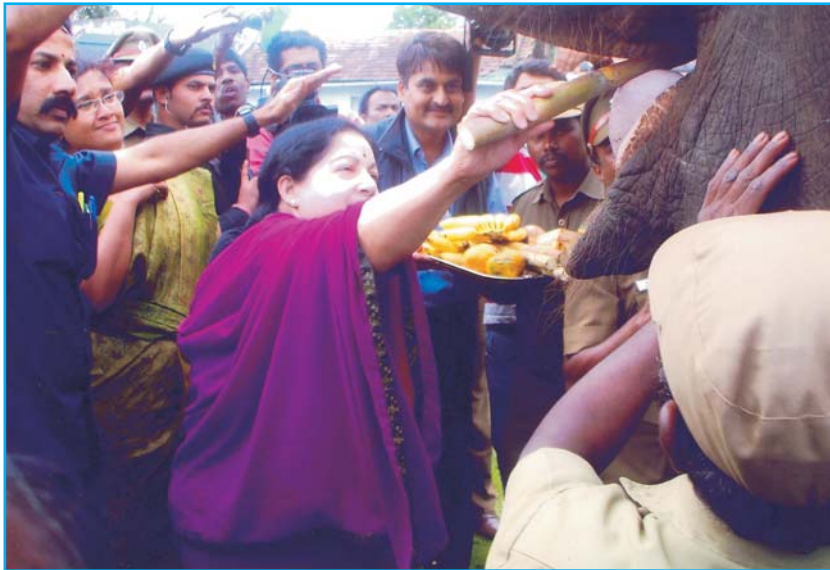
Hon'ble Chief Minister feeding an elephant at Mudumalai Tiger Reserve at Theppakkadu