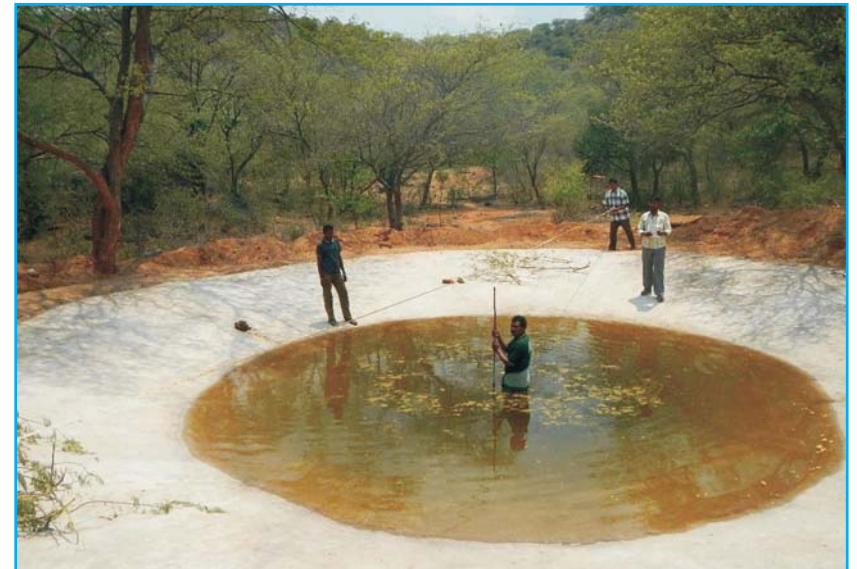
Creation of water trough at Sathyamangalam Tiger Reserve