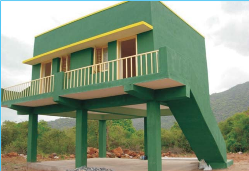
Anti-poaching shed constructed at Sathyamangalam division under Tamil Nadu Biodiversity Conservation and Greening Project