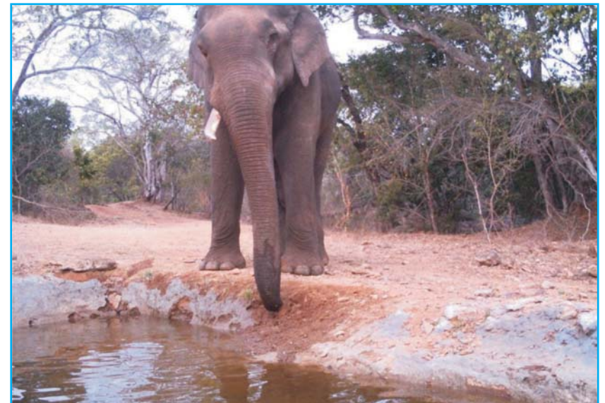
Augmentation of water supply to wildlife in Sathyamangalam division