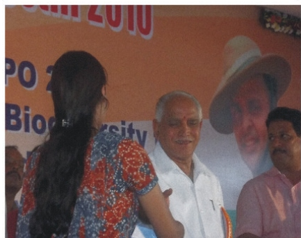
Swadesh Prem Jagriti Sangosthi,