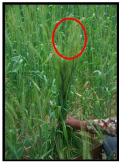
Standing crops: Height = 120cm to 100cm & No. of spikes per sq.ft. = 60 to 65 spikes