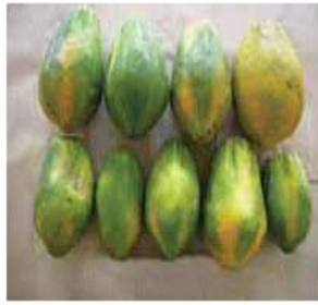
Papaya fruits 3day after storage at room temperature