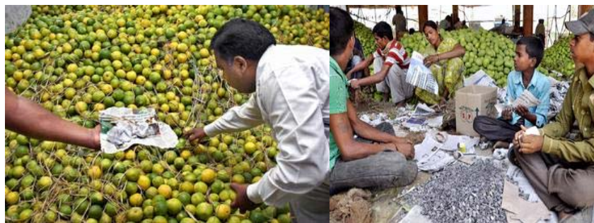
Workers at a fruit market using calcium carbide to ripen raw mangoes

Most climacteric fruits in India are ripened with industrial grade calcium carbide. Industrial-grade calcium carbide usually contains traces of arsenic and phosphorus, and, thus, use of this chemical for this purpose is illegal in most countries. In India too, use of calcium carbide is strictly banned as per PoFA (Prevention of Food Adultration) Act [Section 44AA] . Calcium carbide, once dissolved in water, produces acetylene which acts as an artificial ripening agent. Acetylene is believed to affect the nervous system by reducing oxygen supply to brain. Arsenic and phophorus are toxic and exposure may cause severe health hazards.