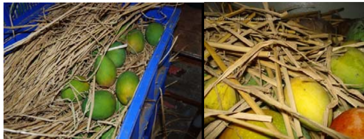
Mango ripening using paddy straw