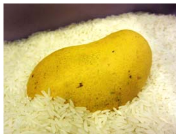
Mango ripening in air tight rice bin