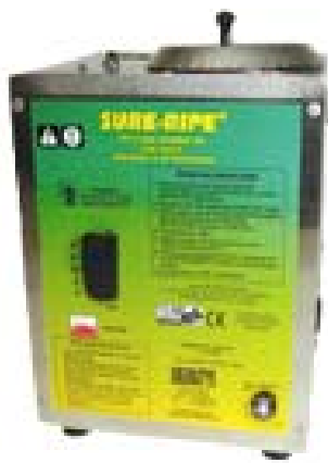
Catalytic generator for ethylene production in ripening rooms