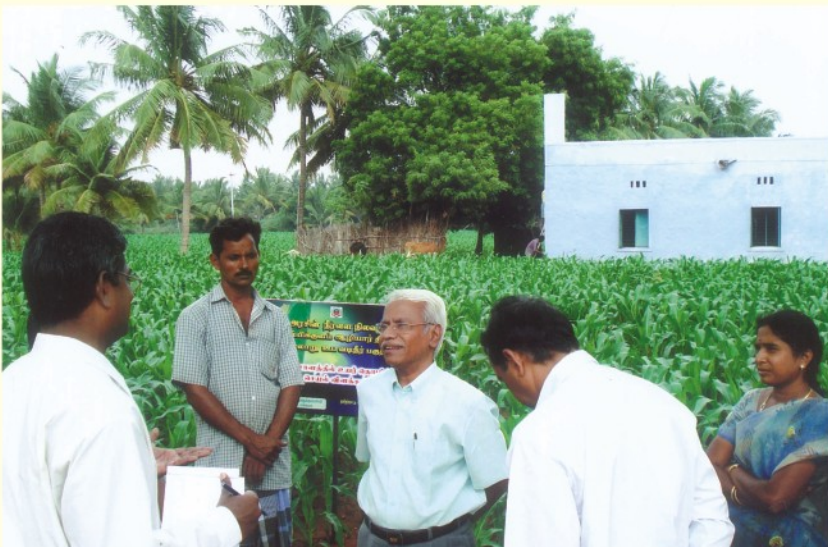
The Vice-Chancellor, TNAU, Coimbatore made a field visit on 18.10.2007 to inspect improved production technology in maize

and System of Rice Intensification (SRI) demonstrations laid out in Palar and Aliyar sub basins respectively under TN-IAMWARM project.